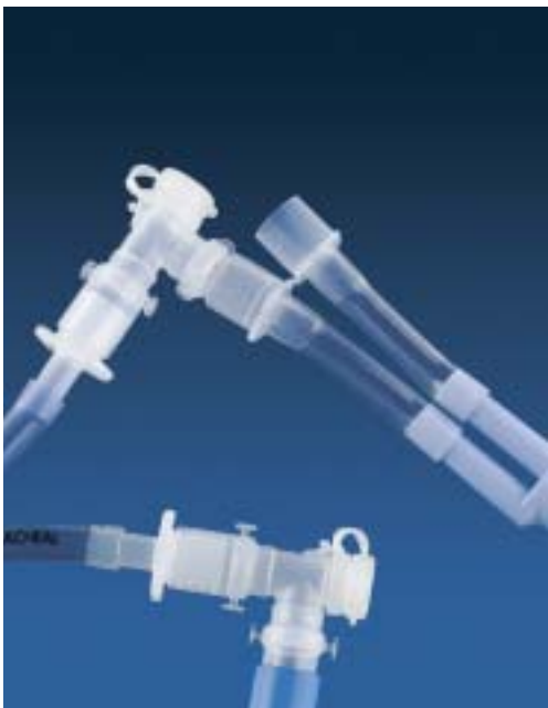
Opti-Port™ Swivel Connector available with left and right versions