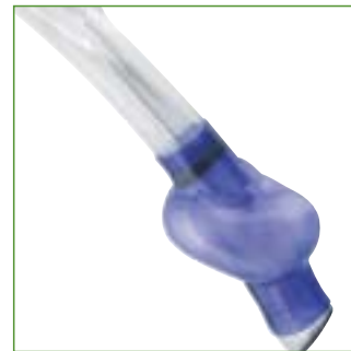
'S' shaped bronchial cuff